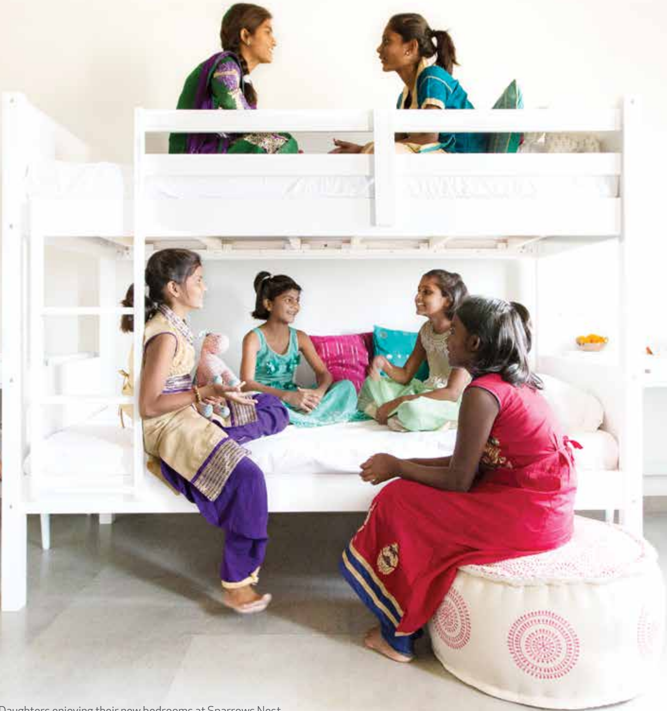
Daughters enjoying their new bedrooms at Sparrows Nest

You can be the change agent setting a new direction for a child's life. You can help rescue them from darkness and give them a life and future that is full of hope! We look forward to partnering with you in 2018!