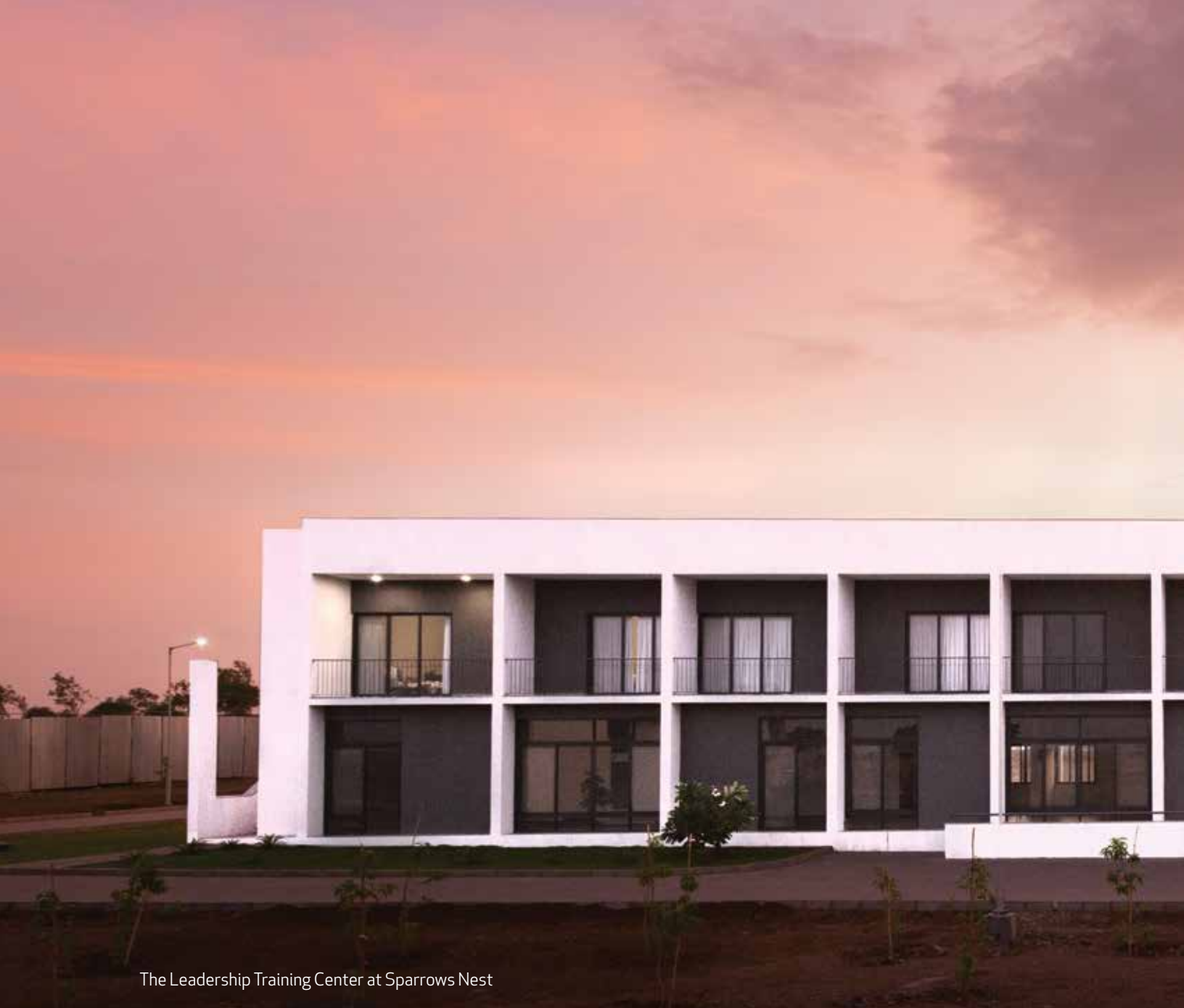
The Leadership Training Center at Sparrows Nest